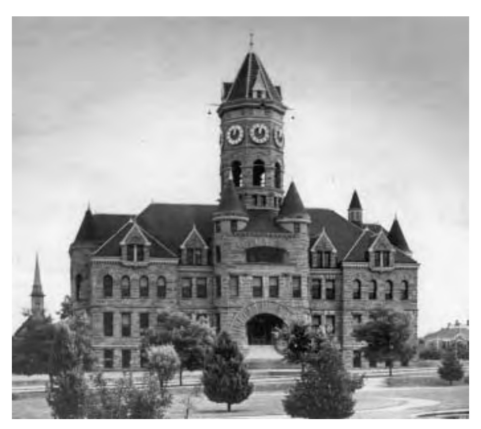
Thurston County Courthouse The state purchased the courthouse in 1901 and was used by the legislature from 1905 to 1928. The building, which is located at Legion and Washington St., now houses the offices of the Superintendent of Public Instruction.

As the session closed most newspapers applauded the Governor's veto of the capital removal bill. They also generally were complimentary of the passage of the Railroad Commission legislation, though the <u>Seattle Times</u> maintained the bill was passed for all the wrong reasons. Generally, the press gave the Legislature mediocre marks and a couple of the larger papers complained that there was far too much horse-trading. As is customary, all seemed relieved when the Legislature went home without having done too much damage.