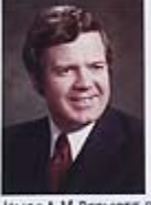
JAMES A. McDERMOTT - D KING, PORT