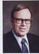
NAT W. WASHINGTON - D KITITSAP, GRANT, PORTLAND YAKIMA, PORTLAND