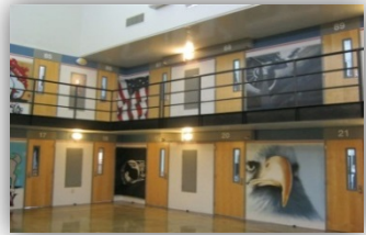
Stafford Creek Veterans Pod