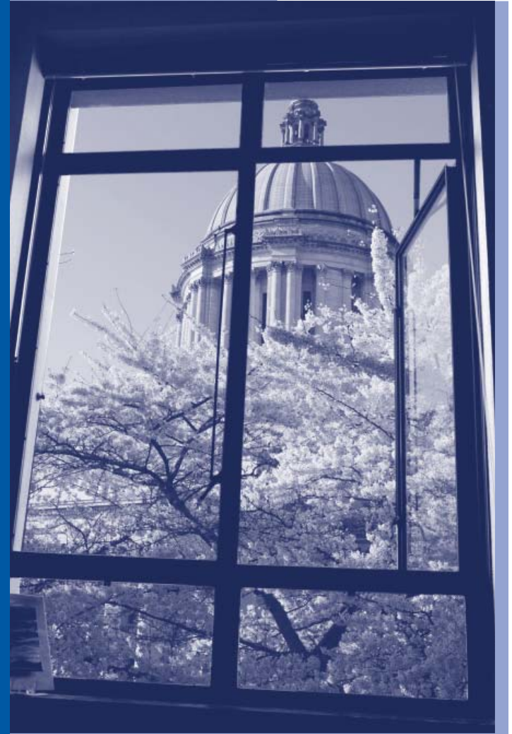
The view from my Olympia office.