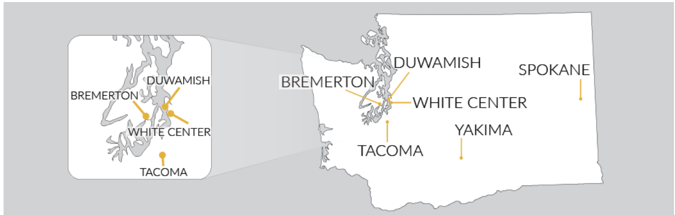
Exhibit 2.1: Washington's CEZs are located within six cities or unincorporated areas