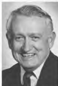
RALPH MUNRO Secretary of State

Republican. Elected as Washington's fourteenth Lieutenant Governor in 1988. He is only the second to be born in Washington, and he brings twenty-four years of public service to his position. He served in the State Legislature from 1958 to 1970 and the U.S. House of Representatives from 1972 to 1984. In Congress, he was the ranking member on the Asian and Pacific Subcommittee of the Foreign Affairs Committee, and the Merchant Marine and Fisheries Committee. He also served as a U.S. Delegate to the General Assembly of the United Nations in 1983. He resides in Seattle.