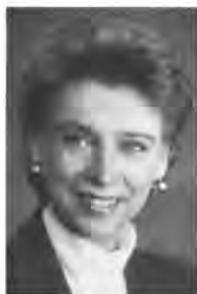
CHRISTINE O. GREGOIRE Attorney General