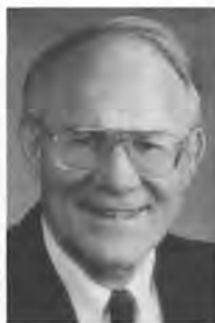
JOEL PRITCHARD Lieutenant Governor

Republican. Elected as Washington's fourteenth Lieutenant Governor in 1988. He is only the second to be born in Washington, and he brings twenty-four years of public service to his position. He served in the State Legislature from 1958 to 1970 and the U.S. House of Representatives from 1972 to 1984. In Congress, he was the ranking member on the Asian and Pacific Subcommittee of the Foreign Affairs Committee, and the Merchant Marine and Fisheries Committee. He also served as a U.S. Delegate to the General Assembly of the United Nations in 1983. He resides in Seattle.