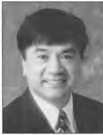
GARY LOCKE Governor

Gary Locke was elected Washington's 21st governor on November 5, 1996, making him the first Chinese-American governor in U.S. history. As governor, he has worked to make Washington public schools the best in the nation, promote jobs and economic development in rural and urban areas, and fight juvenile crime.