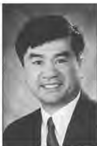
GARY LOCKE Governor

Washington Gov. Gary Locke was elected the Evergreen State's 21st governor on Nov. 5, 1996, making him the first Chinese-American governor in U.S. history. On Nov. 7, 2000, he was re-elected to his second term.