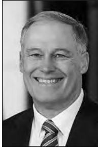
JAY INSLEE Governor