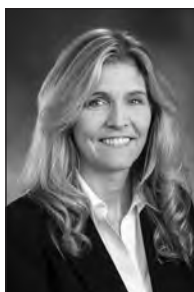
TINA ORWALL Speaker Pro Tempore