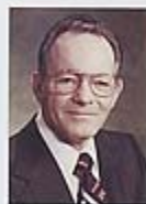
LOWELL PETERSH-D SNOHOMISH, part WATKIN, part