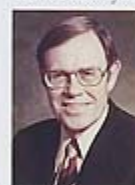
NAT W. WASHINGTON-D BOTTLE - SMITH, part YAKIMA, part