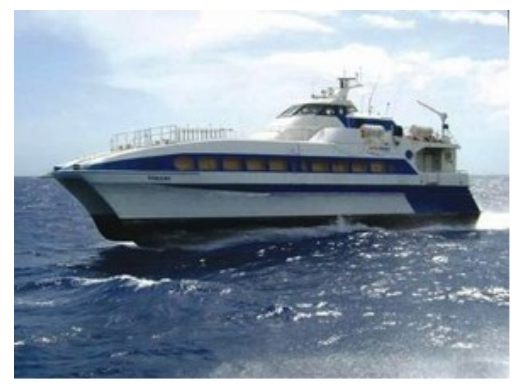
Example Lease Vessel

For first 2 years, lease vessels For long-term operations, procure new vessels to specification