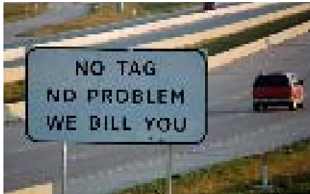
Example of signs on toll road in Texas.