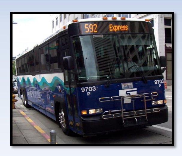
System Efficiencies & Congestion Relief