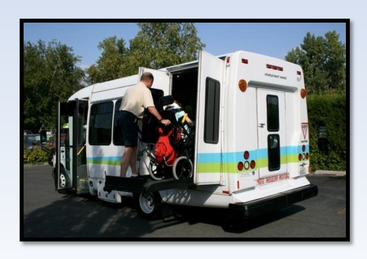
Social Safety Net