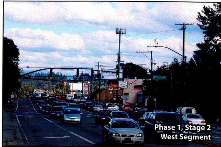
Phase 1, Stage 2 West Segment