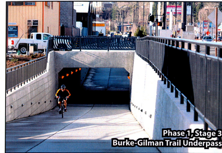
Phase 1, Stage 3 Burke-Gilman Trail Underpass