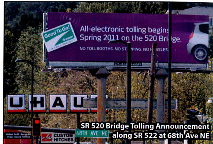
SR 520 Bridge Tolling Announcement along SR 522 at 68th Ave NE