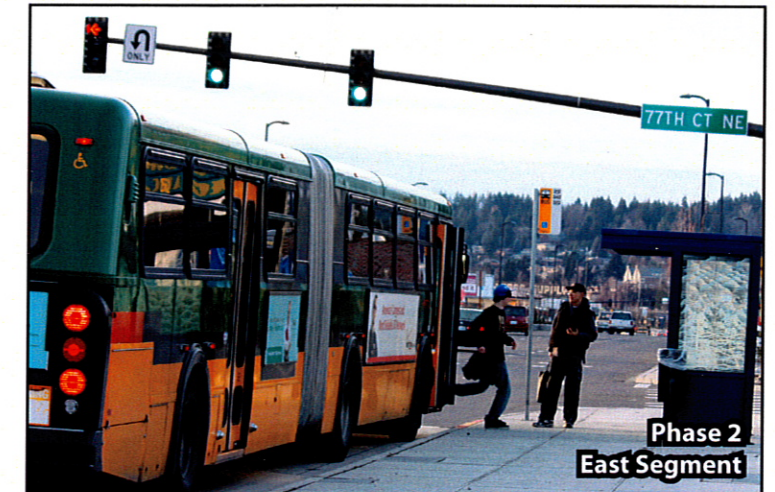
Phase 2 East Segment