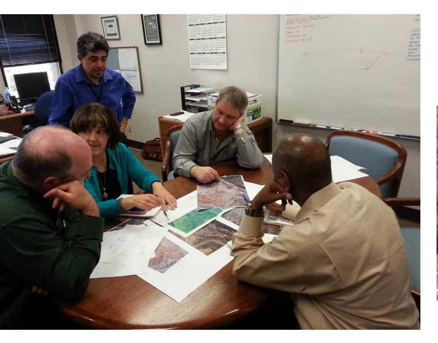
WSDOT employees brainstorming how to "make it work"