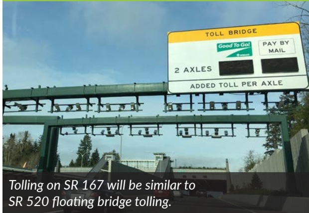
Tolling on SR 167 will be similar to SR 520 floating bridge tolling.