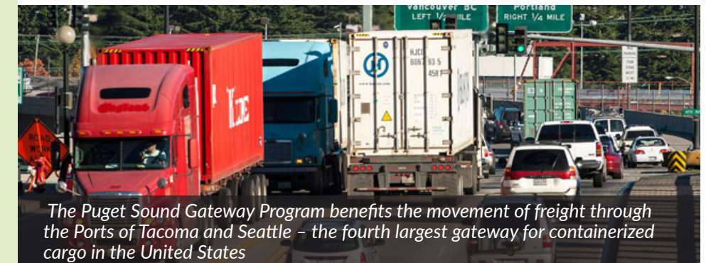
The Puget Sound Gateway Program benefits the movement of freight through the Ports of Tacoma and Seattle - the fourth largest gateway for containerized cargo in the United States

Funding for the total Puget Sound Gateway Program will come from the state gas tax, tolls, local contributions, and potential federal grants. Total funding for the project is $1.87 billion; $1.57 billion will come from the Connecting Washington Revenue Package, tolling will be $180 million, and local contributions will be $130 million. WSDOT is also seeking a federal grant.