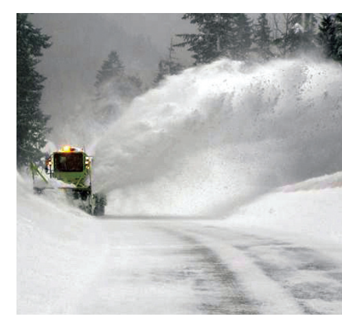
US 12 near White Pass