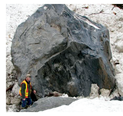
SR 20 Avalanche near Newhalem, WA

The total snowfall at White Pass to this