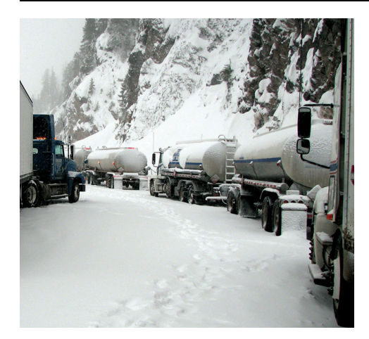
US 12 White Pass