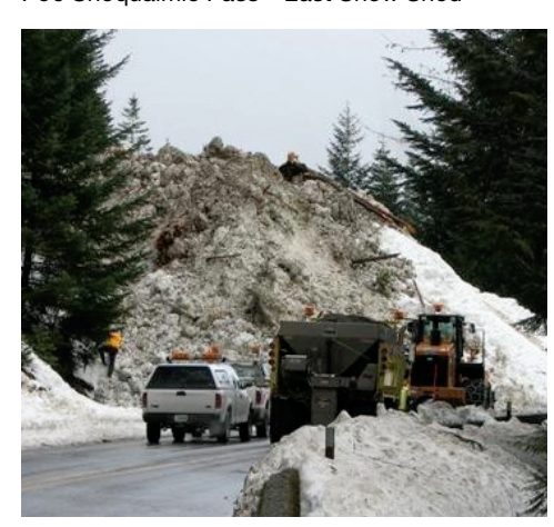
SR 20 Avalanche Newhalem, WA