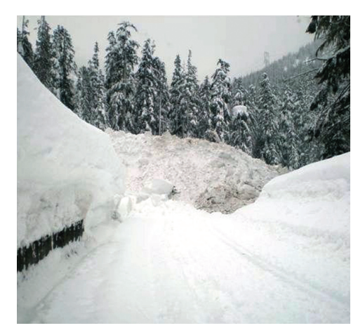
Avalanche on US 2 Stevens Pass