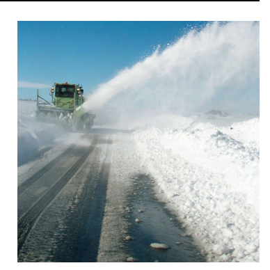
US 2 near Spokane