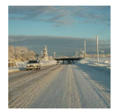
US 2 near Spokane

The avalanche control work at the passes was substantial. For the season, we've conducted over 356 individual detonations using about 11,600 lbs. of explosives, plus we've fired about 135 rounds from either the tanks or a 105 mm recoilless rifle.