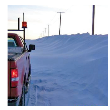
County Road near Wilbur, WA