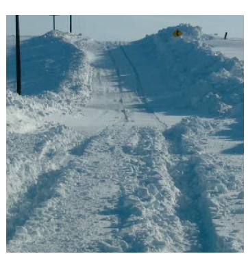
County Road near Sprague, WA