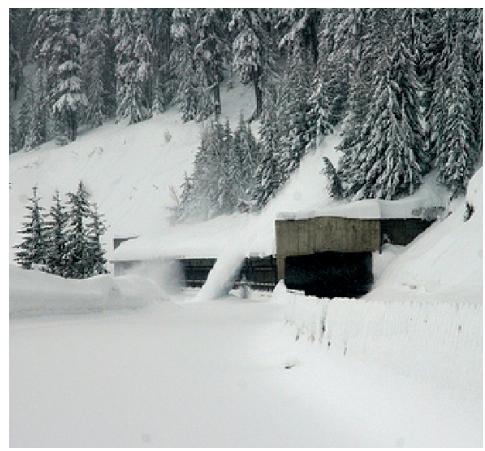
I-90 Snoqualmie Pass - East Snow Shed