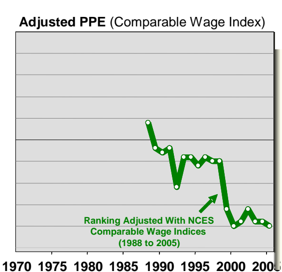
Chart 1. Washington's Ranking on Per-Pupil K–12 Educational Expenditures (PPE) (1 is the state with the highest PPE, 51 is the state with the lowest)

Source: WSIPP. Data from the U.S. Department of Education, National Center for Education Statistics. Data are for academic years 1969-70 to 2004-05. The Comparable Wage Index used here is a composite of the Comparable Wage Index by Lori Taylor (2007) and the General Wage Index by Dan Goldhaber (1999).