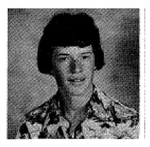
Rodney Newport H.S. Tom yearbook