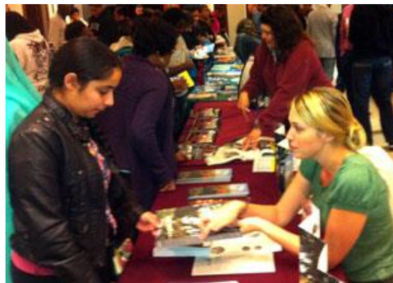
Kent School District and Green River Community College partnered for the third annual College Bound Scholarship conference. Over 500 attended.