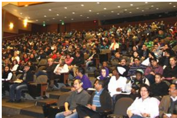
More than 500 students and family members in Kane Hall at UW's annual Seattle Is College Bound conference.