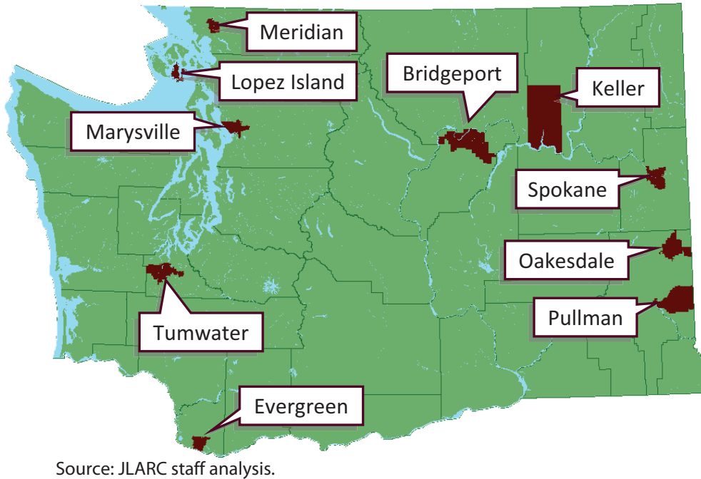
Exhibit 5 – Map of Participating School Districts

Exhibit 5, below, lists the ten participating districts and their locations.