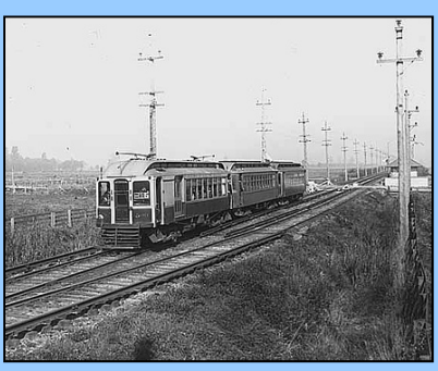
Seattle-Tacoma interurban railway, near Kent, ca. 1909