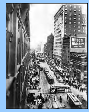
Seattle traffic scene (date unknown)