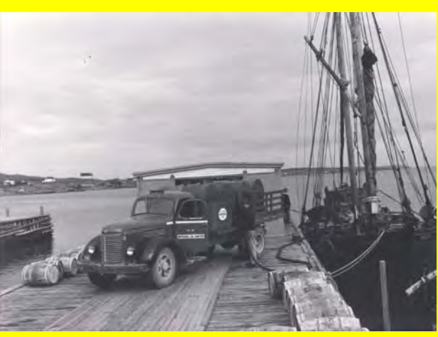
Oil truck delivering fuel, 1948