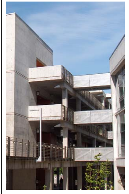
The Evergreen State College Seminar II building

Impact of high performance requirements on public building design and construction costs