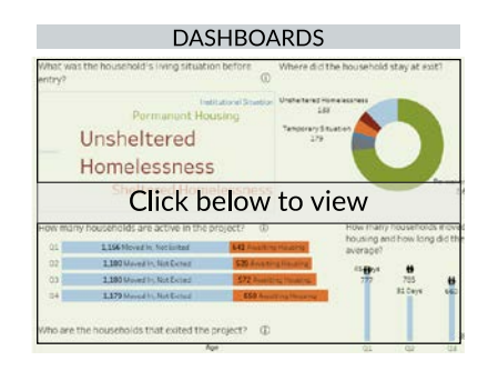
Exhibit 1.3: Commerce provides homeless system performance data through interactive online tools