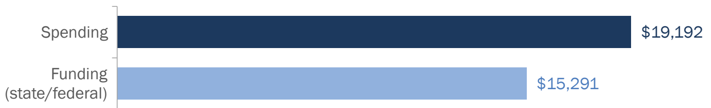
Figure 4: Per student special education spending exceeds state and federal funding

Values are weighted averages.