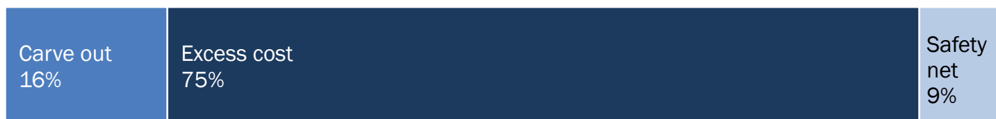
Figure 1: Excess cost funding is the largest portion of state special education funding

Source: OSPI F-196 financial summary database for 2022-23 school year.