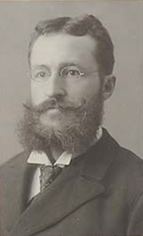
Lieutenant Governor DANIELS