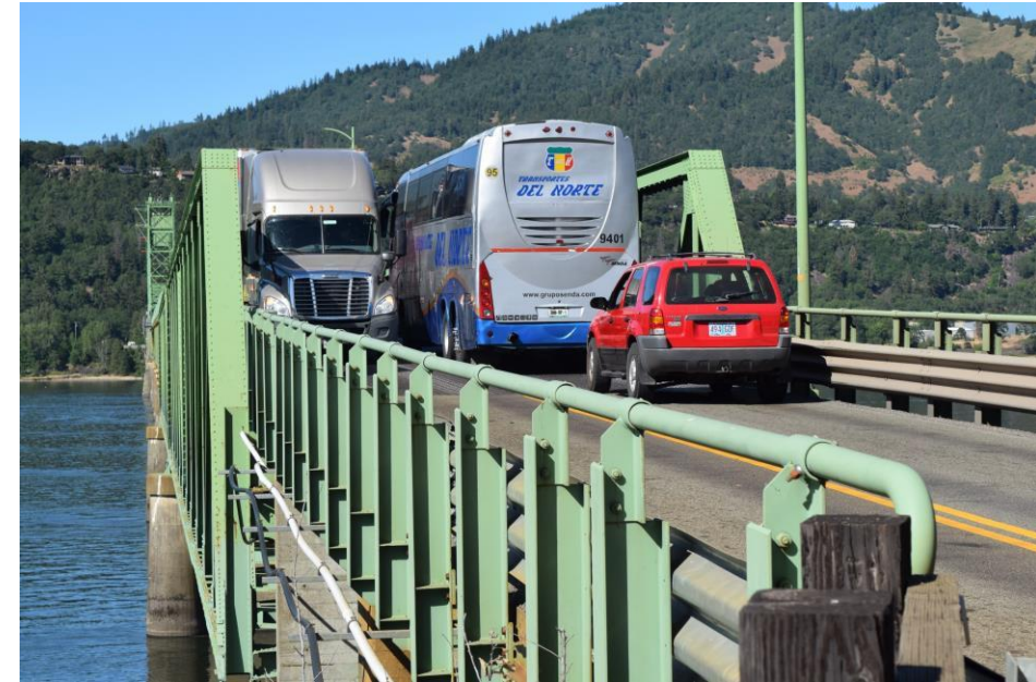
Narrow lanes and shoulders on existing bridge do not meet current standards