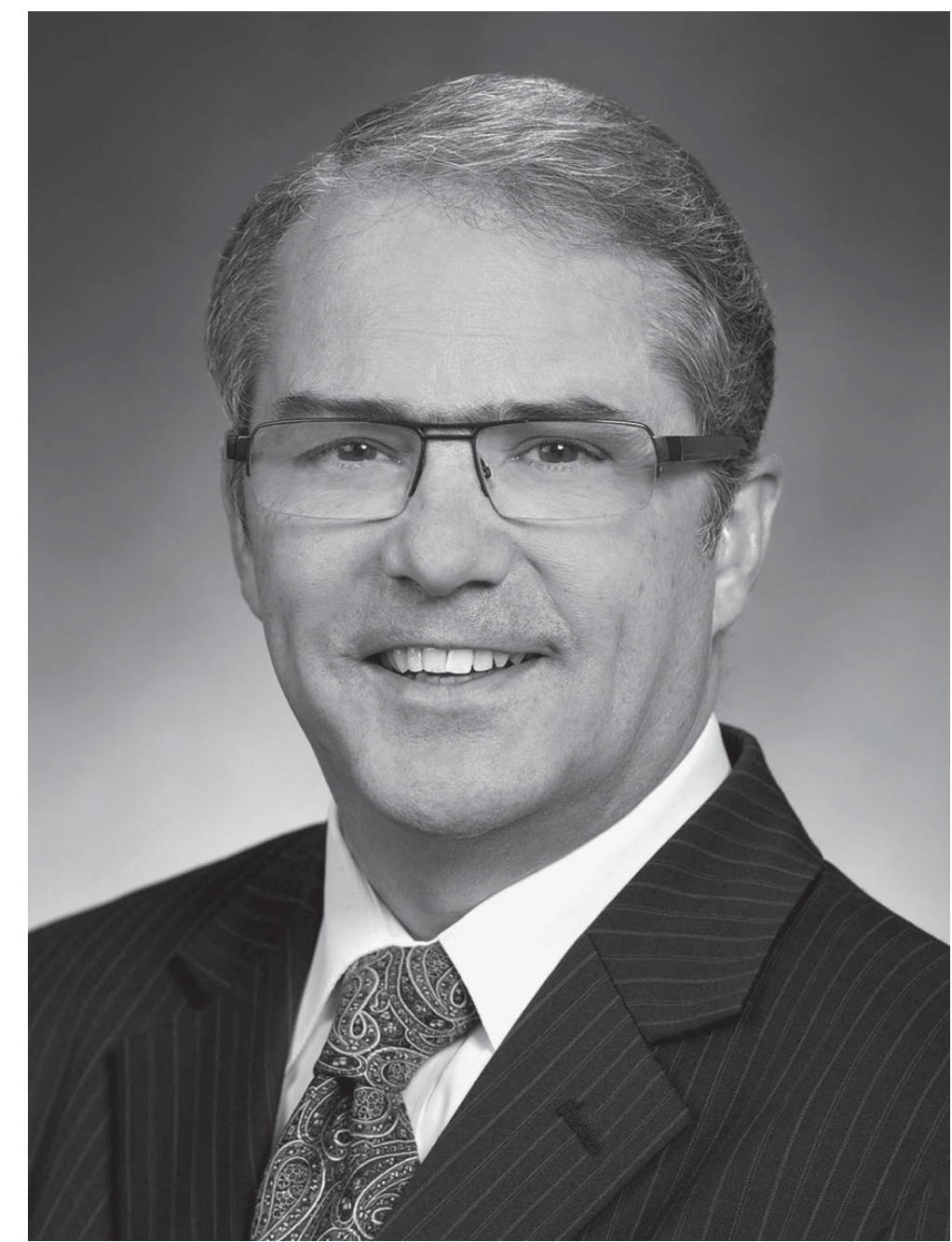
LIEUTENANT GOVERNOR Brad Owen—D PRESIDENT OF THE SENATE