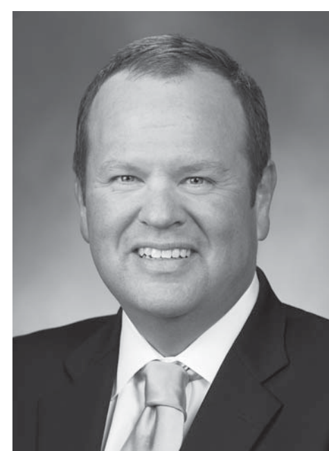
Hunter G. Goodman Secretary of the Senate