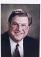
Sid Snyder - R SECRETARY OF THE SENATE